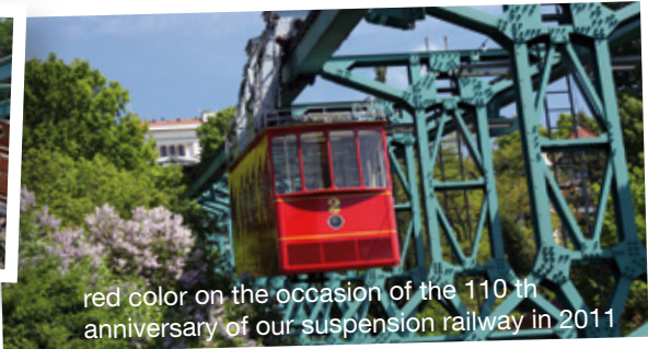
red color on the occasion of the 110 th anniversary of our suspension railway in 2011